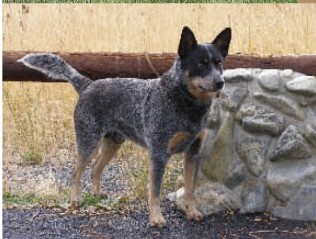
Above Left: Ch. Buzzards Vinita Cowboy, HSAS, HRDI, STD(s), Can. HS