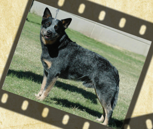
Am. Ch. So-Lo's Hard Working Man

Rider finished with Back to Back BOB's and Majors in Tucson, November 2008 AND a total of Four Majors!!