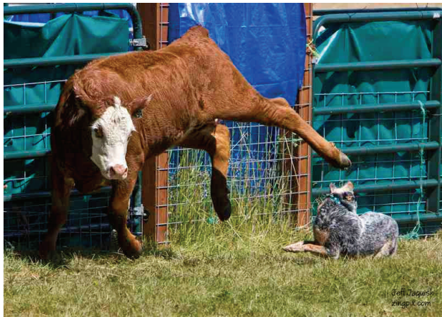
2008 — Merry at Whidbey Island