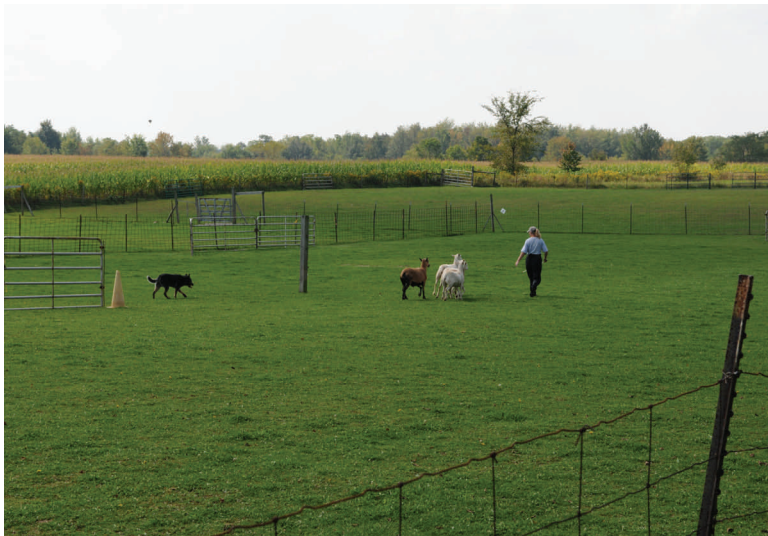
Tank aka AE's Road Warrior, HSAs, STDs, JHD, CD, RN

Despite his handler, Tank managed to finish his STDs and his HSAs. His dam, Jaz, finished her STDs, but remains one leg short on her HS. She did earn extreme sympathy from the judge who asked me, "WHAT were you thinking!?"